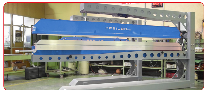
Stand with assisted lifting system for workshop work (optional).