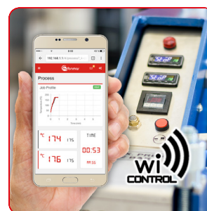
Possibility of incorporating Wi-Control (optional).